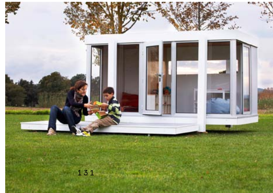
The Illinois model.