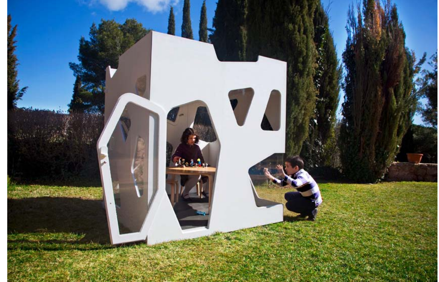
The Kyoto Junior model.

'Architect Barbie helps parents to broach the topic of Zaha Hadid with their children more easily'