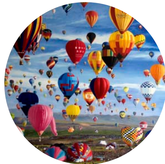
The Bride , 2012, Oil on canvas, 124,5 cm diameter, courtesy of Benrimon Contemporary, photography: Joseph Sturges