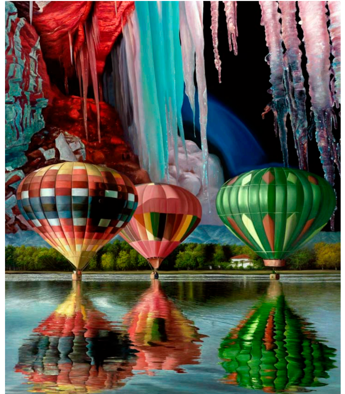
Splendor Falls , 2011, oil on Canvas, 165,1 x 139,7 cm, courtesy of Benrimon Contemporary, photography: Joseph Sturges