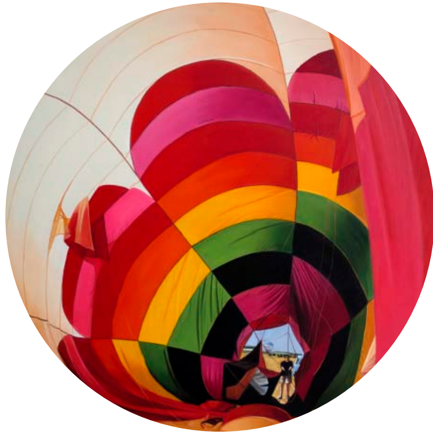
The Moon Spinners , 2012, Oil on canvas, 124,5 cm diameter