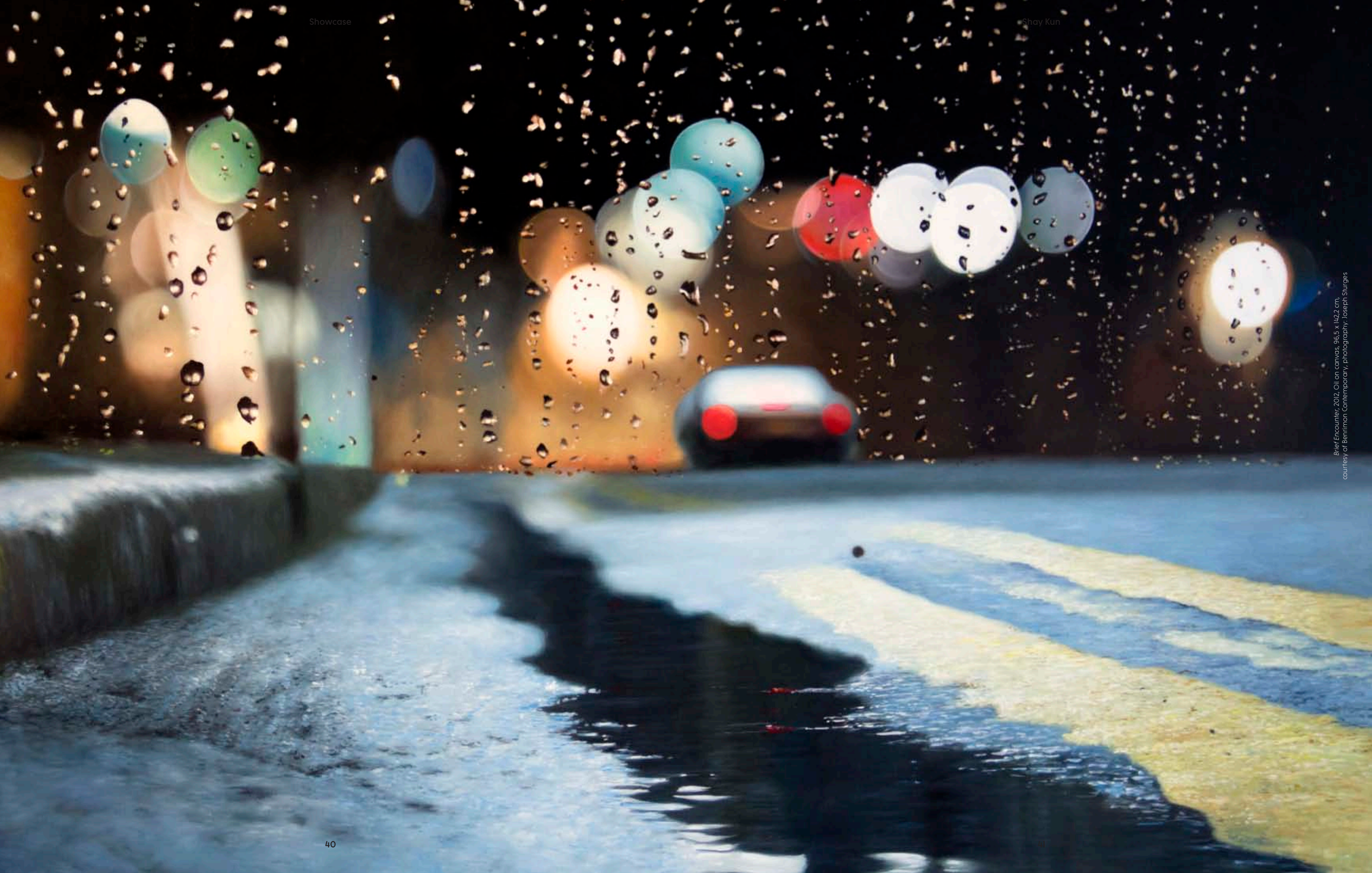
Brief Encounter, 2012, Oil on canvas, 96.5 x 142.2 cm, courtesy of Benimoh Contemporary, photography: Joseph Sturges